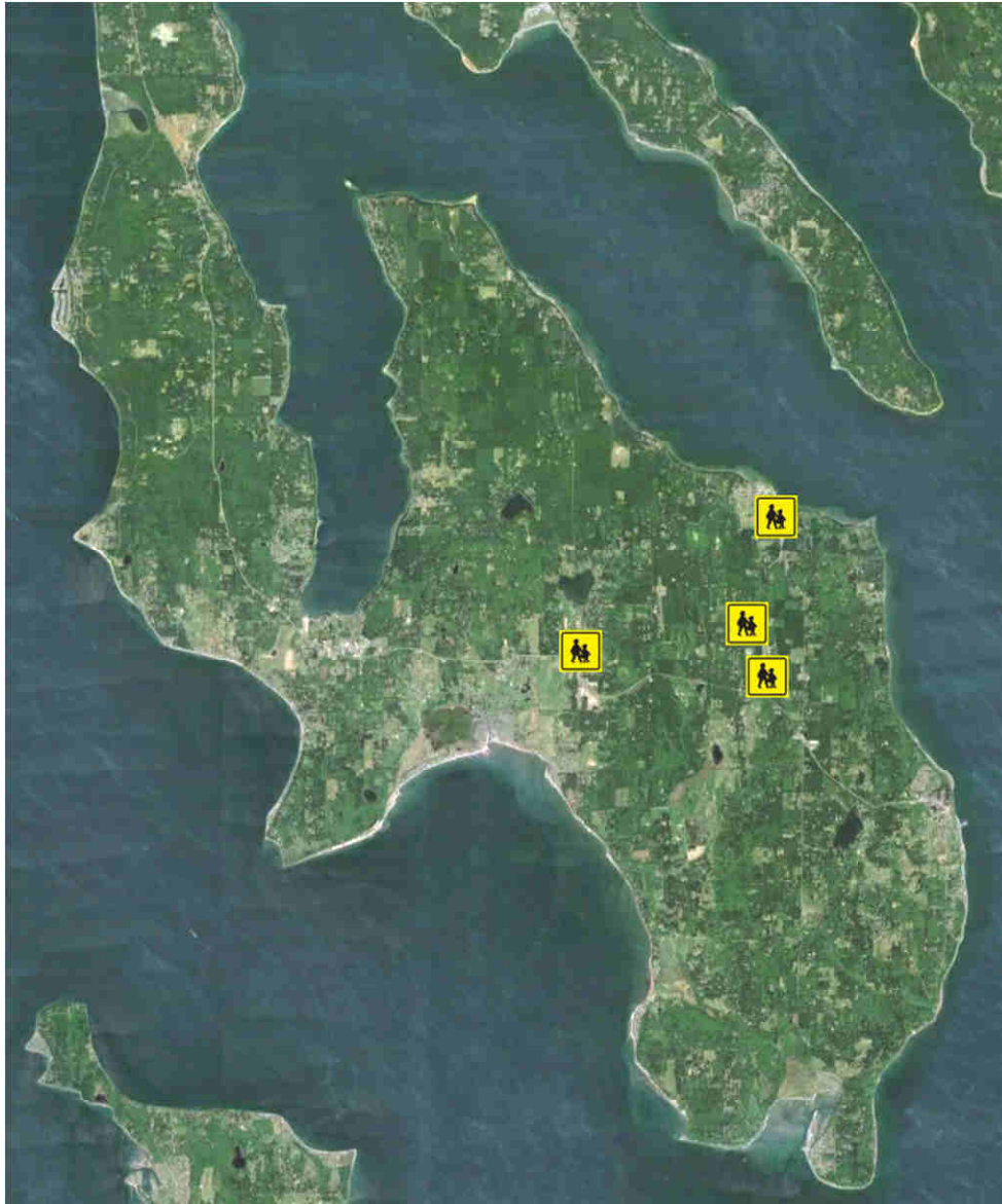
Figure 2.2 South Whidbey School District and Vicinity